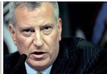
New York City Mayor Bill de Blasio speaks Saturday during a news conference to provide an update of the Legionnaires' disease outbreak in New York.

"They brag about slashing women's health care funding," Clinton told reporters while campaigning in New Hampshire. "They say they would force women who have been raped to carry their rapist's child, and we don't bear any of them supporting raising the minimum wage, paid leave for new parents, access to quality child care, equal pay for women or anything else that will help to give women a chance to get ahead."